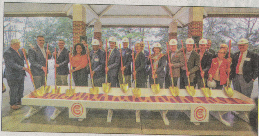
Clemson University officials pose during a special groundbreaking ceremony for the new Clemson Alumni and Visitors Center on Wednesday evening.