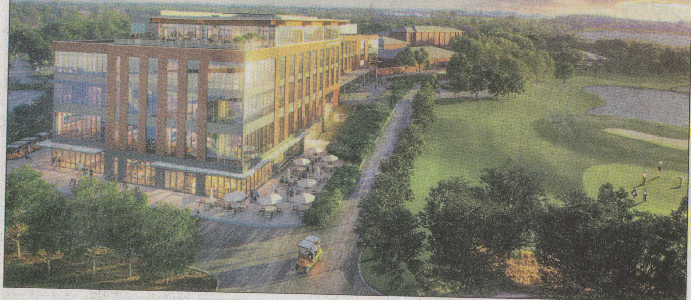
This rendering shows what Clemson University's new Alumni and Visitors Center could look like when it is completed, which officials expect to be late next year.