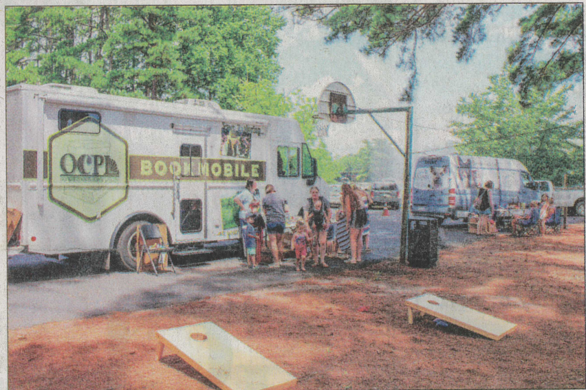
Oconee County Public Library's Bookmobile was stationed at the End of Summer Bash on Wednesday at South Cove County Park.

Reading Program with playtime at the park and in Lake Keowee, games, food and prizes.