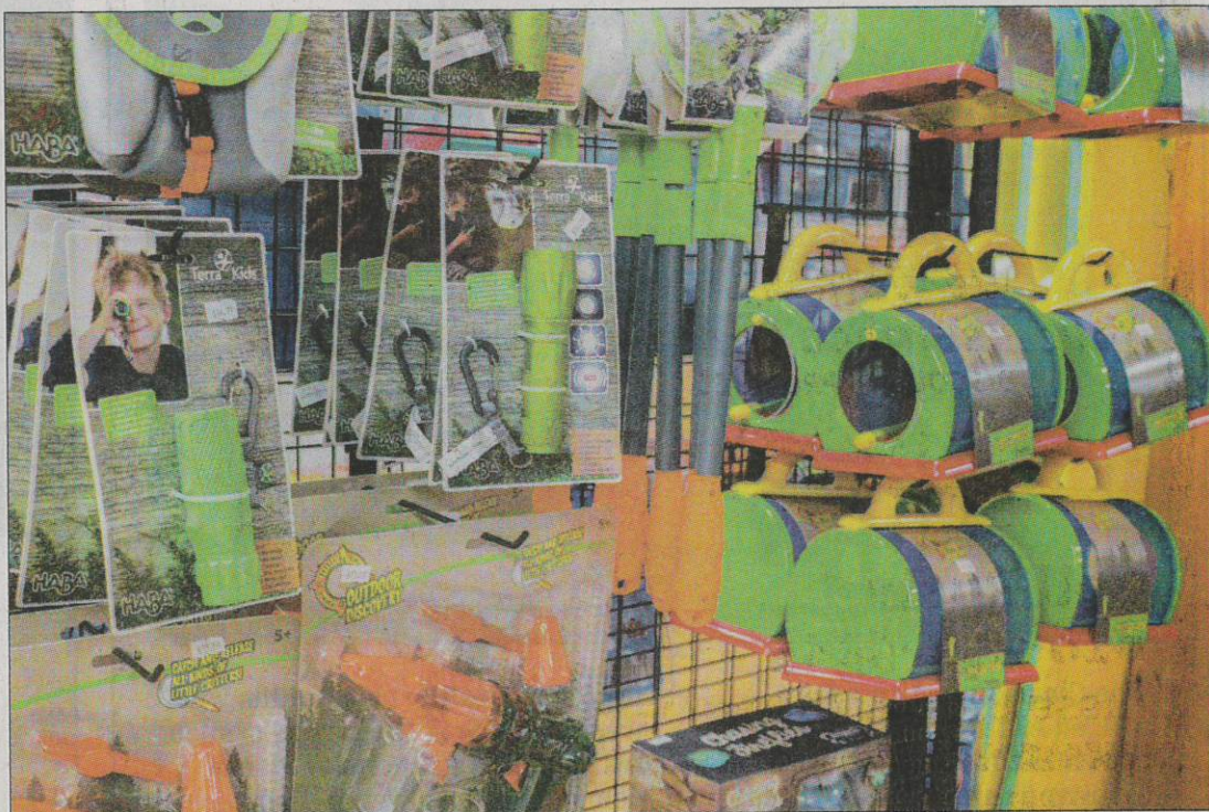
Keowee Outdoors offers kids' outdoor gear and equipment at the store in Seneca.