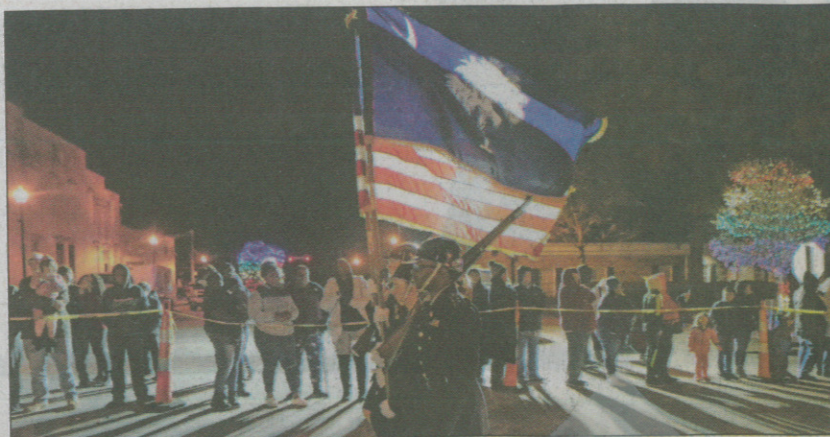
Members of the Seneca High School Army JROTC march in the Seneca Christmas parade on Main Street on Monday night.