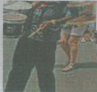
Street performers and parades are part of Artisphere presented by TD Bank, going on Friday through Sunday.