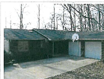
View Pictures (17)