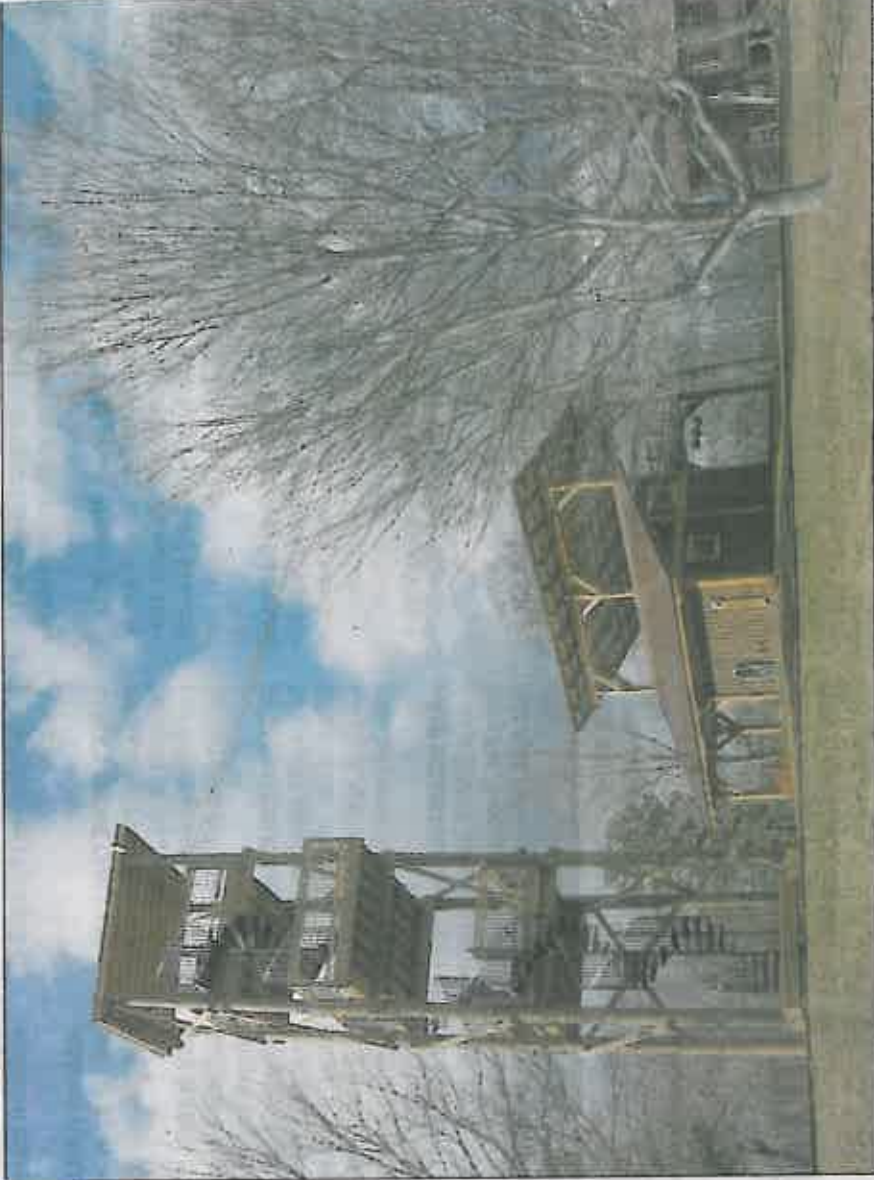
FOR THE JOURNAL

"We've noticed that ziplining and rafting have a crossover, too. Some people want to do both, and groups are able to split up — some don't want to get wet, so they zipline, and others